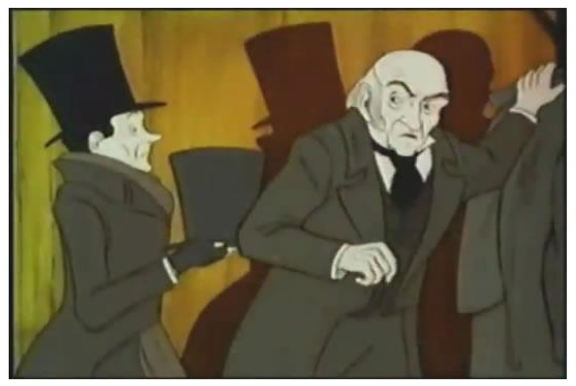
It was Christmas eve, Ebenezer Scrooge a mean miserly man, was closing his shop. Bob Cratchett, his employee, was happy tomorrow was Christmas. Scrooge felt Christmas was humbug.